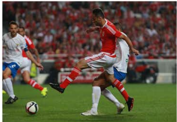
POSSIBILITY OF OPTION TO SEE BENFICA vs GUIMARAES SOCCER MATCH IF THE GAME IS ON SATURDAY NIGHT TICKETS ARE NOT INCLUDED

Immerse yourself in an oasis of peace between gently undulating green fields where aromatic and refreshing pine trees, almond and fig trees provide shade to the tireless practitioners of the sport.